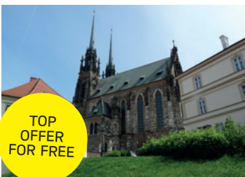
CATHEDRAL OF SAINTS PETER AND PAUL

The cathedral on Petrov Hill is the most significant sacral building in the city, and since 1777 it has been the residence of the Brno bishop. Its current appearance – the Gothic cathedral with two towers – comes from the turn of the 19 th and 20 th centuries and is even depicted on the Czech ten-crown coin. Make sure to climb the stairs up the tower for a view of Brno spreading out under your feet.