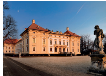
SLAVKOV – AUSTERLITZ CHATEAU

At the baroque Slavkov-Austerlitz chateau, visitors can choose from various tours and exhibitions, including a tour for kids, and even try on period costumes. Adjacent to the chateau is a large park with pools and various statues, open for free all year. A place where Napoleon Bonaparte spent some time after the Battle of Austerlitz in 1805. Various cultural events take place here year round.