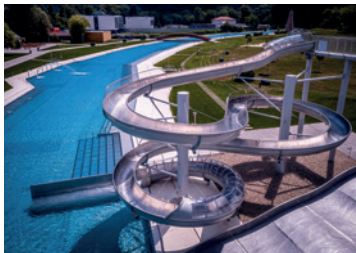
RIVIÉRA OUTDOOR SWIMMING POOL

The biggest swimming pool in Brno, with a large wading pool, stainless steel pools up to 170 cm deep, an 8-metre tall water chute, a 15-metre water slide, fountains, a rope bridge with water lilies, and a climbing wall. The little ones will enjoy playing with water cannons, a bucket tree, and the fountains. The area also offers chances to play beach volleyball, table tennis, and pétanque. Huge premises ideal for relaxing and having fun.