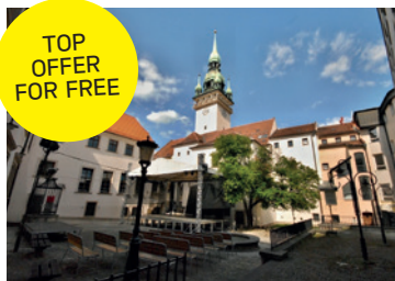
OLD TOWN HALL STARÁ RADNICE

There are many legends about the Old Town Hall, the most famous of which are the stories of the Brno dragon and the Brno wheel. You'll find these symbols of Brno in the passage to the Old Town Hall. Climb the 63-metre tower with its Renaissance helmet-shaped top and lookout platform. The Old Town Hall is the oldest and most interesting secular building in Brno.