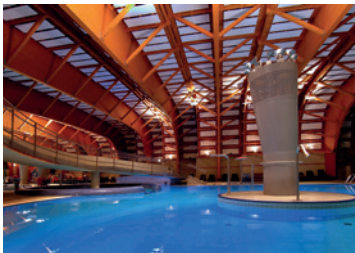
KOHOUTOVICE WATERPARK AQUAPARK KOHOUTOVICE

The biggest swimming pool in Brno, with a large wading pool, stainless steel pools up to 170 cm deep, an 8-metre tall water chute, a 15-metre water slide, fountains, a rope bridge with water lilies, and a climbing wall. The little ones will enjoy playing with water cannons, a bucket tree, and the fountains. The area also offers chances to play beach volleyball, table tennis, and pétanque. Huge premises ideal for relaxing and having fun.