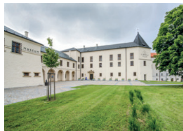
VYŠKOV CHATEAU – MUSEUM OF THE VYŠKOV REGION

The historic Vyškov Chateau houses the Museum of the Vyškov Region with its seven permanent exhibitions, e.g. one devoted to the life and work of Alois Musil or the modern interactive exhibition on the fauna and flora of the region. The museum also organises short-term exhibitions, cultural events, lectures, creative art workshops and animation programmes.