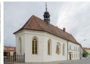
CHAPEL OF ST. ANNE AND GARDEN

The Renaissance chapel with its unique frescos dates back to the first half of the 16 th century. It offers an exhibition on religion and rituals focused on selected chapters from the history of cults and religions from the ancient and medieval history of the western half of the Old World. After the tour, you can relax in the newly renovated garden.