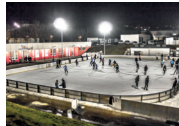
LUŽÁNKY ICE RINK KLUZIŠTĚ ZA LUŽÁNKAMI

The Rašínova Spa and Relaxation Centre downtown offers a swimming pool, whirlpool, wellness zone, and solarium. You can also exercise in the gym and enjoy the café on the first floor.