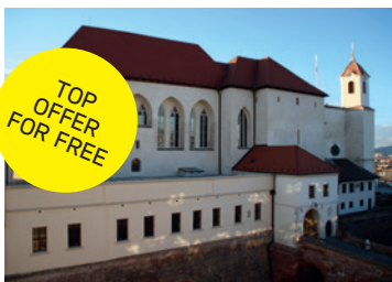
ŠPILBERK CASTLE HRAD ŠPILBERK

Have you visited Špilberk Castle yet? It's a building that from the Middle Ages until today has undergone many changes that most visitors have no idea about. Thanks to the new guided tour The Story of the Castle, you can easily learn more about them. Visitors to Špilberk can also join other guided tours. The castle also offers permanent and temporary exhibitions from the Brno City Museum. From the walls and observation tower, you get the most beautiful view of all of Brno. With BRNOPAS, you get free entry into one of the many choices.