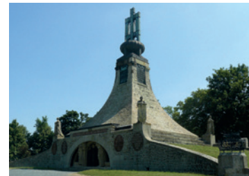
THE MOHYLA MÍRU MONUMENT

The Mohyla míru monument was built to commemorate the Battle of Austerlitz that took place on 2 December 1805. It is the dominant feature and natural centre point of the Slavkov (Austerlitz) battlefield. The museum features a unique permanent multimedia exhibition on the Battle of Three Emperors. Slavkov/Austerlitz 1805, which makes the Battle of Austerlitz accessible in an unconventional way.